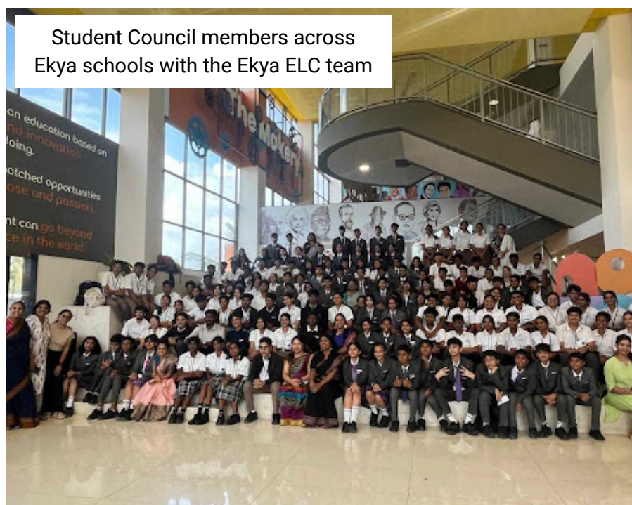
Student Council members across Ekya schools with the Ekya ELC team