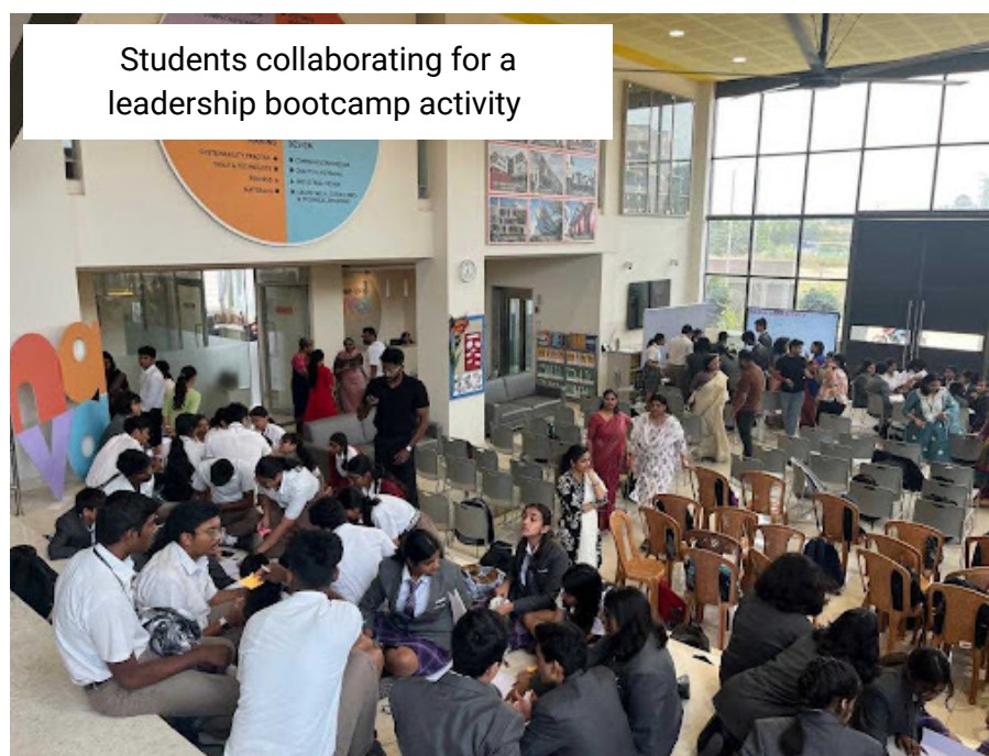
Students collaborating for a leadership bootcamp activity